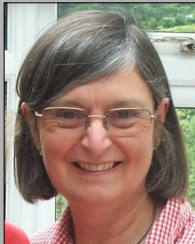
Treasurer / Advertising