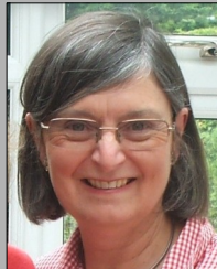
Treasurer / Advertising